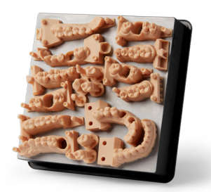
QUADRANT MODELS FOR FIXED PROSTHETICS

Up to 8 splints per print in ^{\sim}2.5 h for $4–6 a part