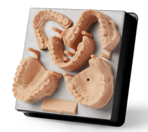
LARGE DIAGNOSTIC MODELS

Up to 2 model sets (upper and lower) per print in ^{\sim}5 h for $6-9 a set