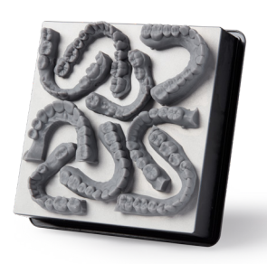
ORTHODONTIC MODELS FLAT TO BUILD PLATE

Up to 8 denture bases per print in ^9 h for 5-7 a part