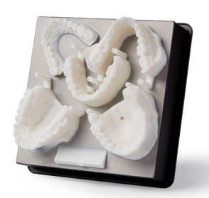
LARGE DIAGNOSTIC MODELS