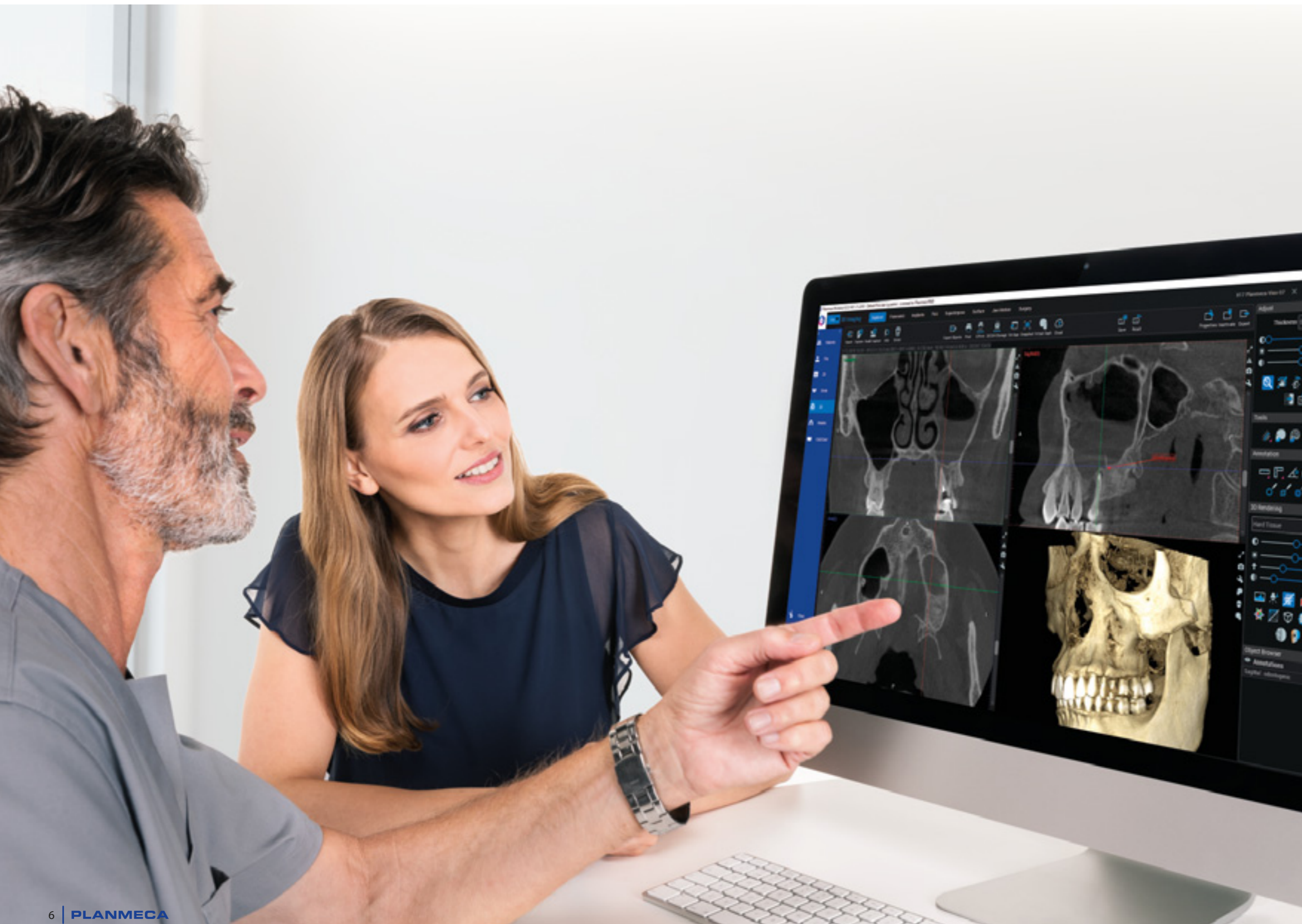
Image quality is among the most important factors in CBCT imaging. Planmeca Viso® units shine in this area, as they allow you to capture crystal-clear images in all situations. Options for ultra low dose imaging, patient movement correction, noise removal, and metal artefact reduction are available as standard features.