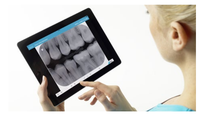
VistaSoft Mobile Connect Imaging App: